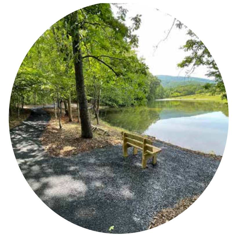
POND LOOP TRAIL