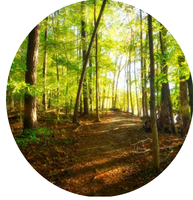
NATURAL SURFACE TRAILS